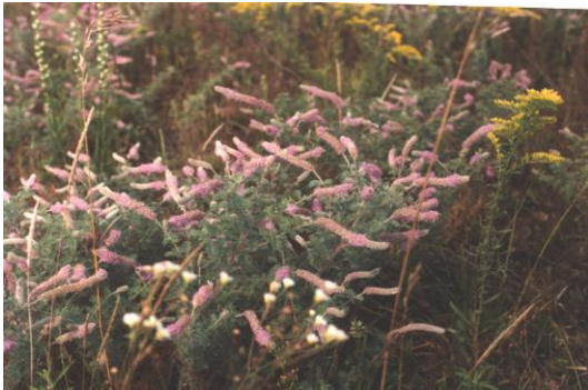
Silky Prairie Clover, one of the rare sand prairie plants found at the Holland Prairie.

TPE is a non-profit organization committed to protection and management of native prairie and savanna of the Upper Midwest. TPE will assist with restoration and management.